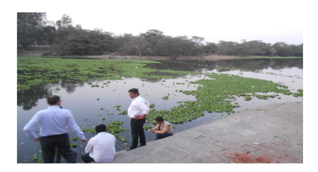
Water Testing In River Pavana.