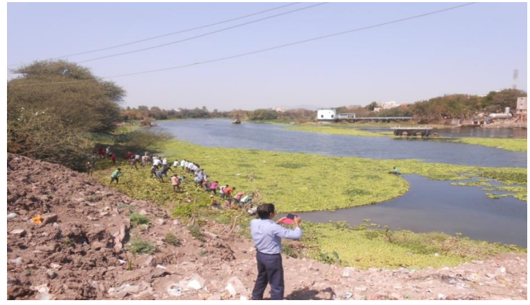
Hyacinths Clear Activities in River Pavana